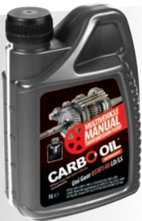
Uni Gear 85W140 LD/LS API GL-4/GL-5/MT-1; Mil-L-2105A/B/C/D/E, Mil-L-PRF-2105E; Meets the requirements of; MAN 341 Typ Z2/E2, MAN 342 Typ M2; Scania STO 1.0;ZF TE-ML 05C/07A/08/12C/16E Shortcode: 20.04