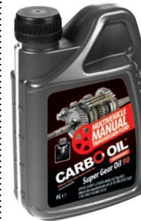
Super Gear Oil 90 API GL-5;Mil-L-2105D; MAN 342 Typ M1; Meets the requirements of; ZF TE-ML 07A/16B/17B/19B/21A; MB 235.0 Shortcode: 17.05