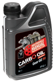
Gear Oil 90 API GL-1 Shortcode: 15.02