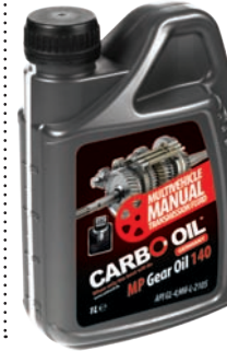
MP Gear Oil 140 API GL-4;Mil-L-2105 Shortcode: 16.08