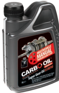
Super Gear Oil 85W90 API GL-5;Mil-L-2105D; MAN 342 Typ M1; Meets the requirements of; ZF TE-ML 07A/16B/17B/19B/21A; MB 235.0 Shortcode: 17.09