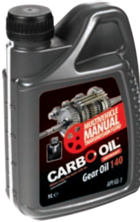
Gear Oil 140 API GL-1 Shortcode: 15.03