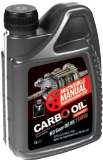
HD Gear Oil HS 75W90 API GL-4/5; Mil-L-2105; Meets the requirements of; VW 501.50 Shortcode: 18.01