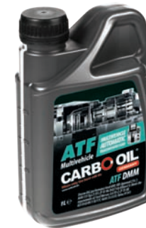
ATF DMM Dexron IIG (performance level IIG); MB-Approval 236.1; MAN 339 Typ Z1/V1;ZF TE-ML 04D/14A; Allison C4; Meets the requirements of; Ford Mercon; Cat TO-2; ZF TE-ML 02F/03D/09/11B/17C; Voith 55.6335; Volvo 97341 Shortcode: 21.02