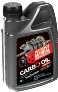
Semi Synthetic 75W90 GL-5 API GL-5; Mil-L-2105D; Meets the requirements of; ZF TE-ML 07A/17B Shortcode: 17.17