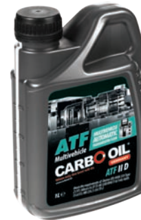
ATF II D Meets the requirements of; Dexron IID;MAN 339 Type Z1/V1; Allison C4; ZF TE-ML 03D/09B/11A/14A; Voith 55.6335; MB 236.1; Cat TO-2 Shortcode: 21.13