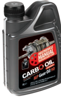
MP Gear Oil 90 API GL-4;Mil-L-2105;Meets the requirements of;ZF TE-ML 16A/17A/19A;MB 235.1 Shortcode: 16.07