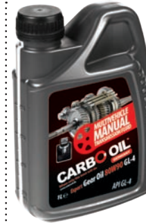
Export Gear Oil 80W90 GL-4 API GL-4 Shortcode: 16.10