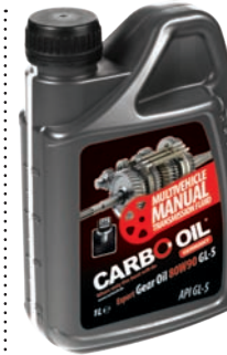
Export Gear Oil 80W90 GL-5 API GL-5 Shortcode: 16.11