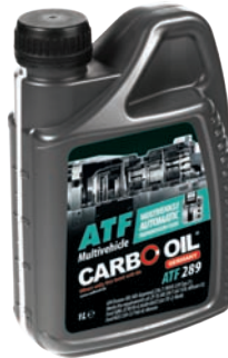
ATF 289 GM Dexron IID; MB-Approval 236.7; MAN 339 Typ Z1; Meets the requirements of; ZF TE-ML 09/11A/14A; Allison C4; Ford SQM-2C9010-A; Voith G607; Cat TO-2; Renk; Ford M2C138-CJ/166-H; Mercon Shortcode: 21.01